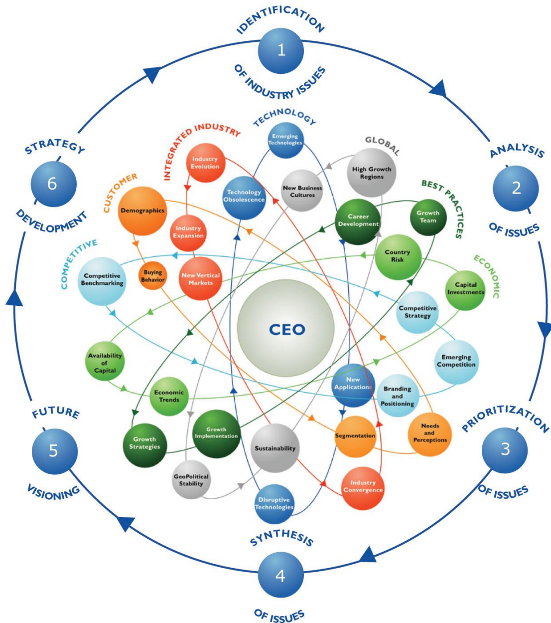
Chart 1: CEO's 360-Degree Perspective™ Model